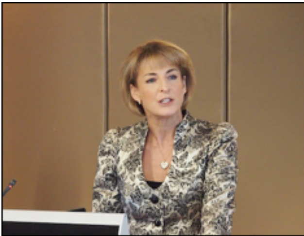
Minister for Women, Senator the Hon. Michaelia Cash

This section provides the transcript of the key address to the National Forum, from the Minister for Women, Hon Michaelia Cash, outlining the Australian Government's priorities and their relationship to women and girls with disability.