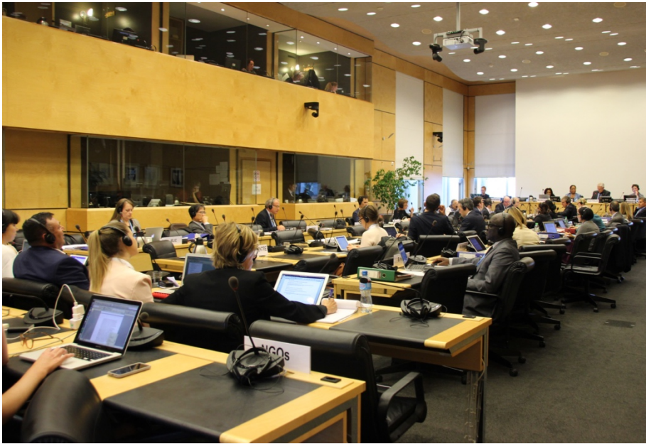
NGO Delegation presenting at formal briefing with the Committee