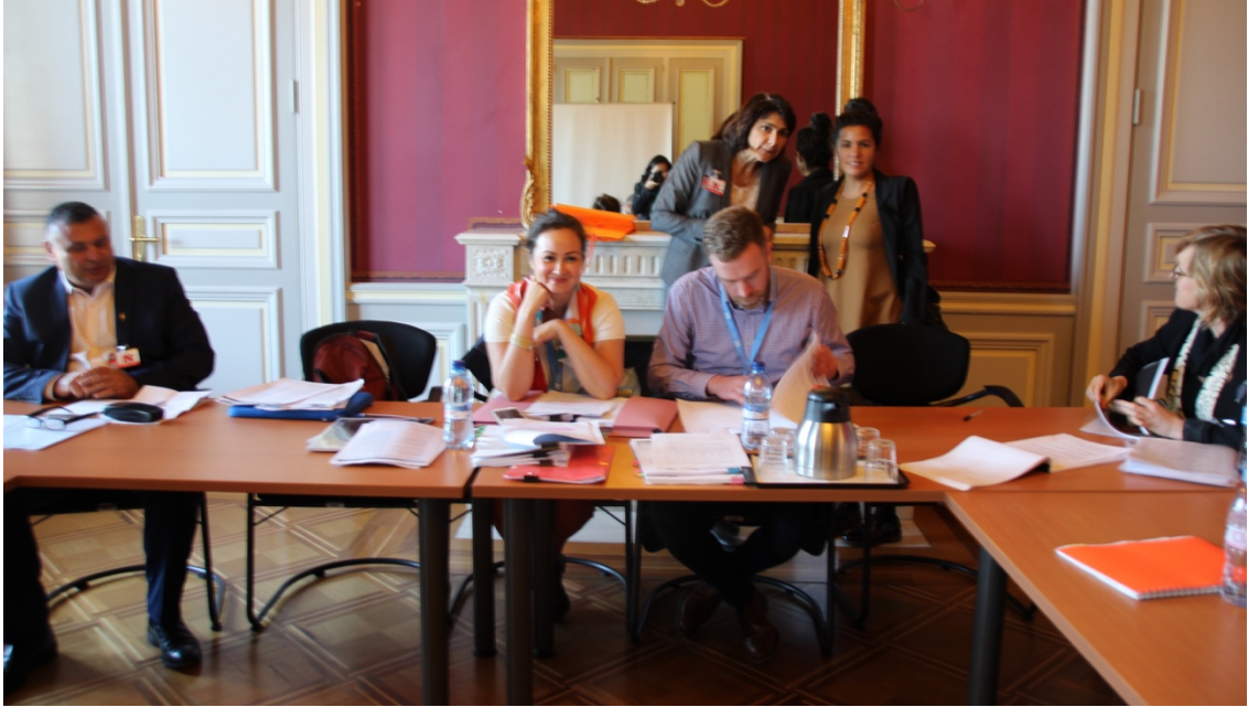
NGO Delegation preparing for informal briefing with the Committee